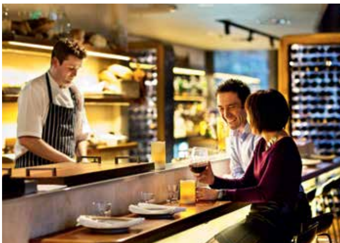
Expressive atmosphere at East Hotel's Ox Eatery, inspired by design elements from the 1950s

At the colourful and brick-walled Playground ( playgroundbar.com.au ), martins, cider and craft beers complement a sprawling tapas menu which features petite versions of favourites like paella. An amazing wall mural by Erin Forsyth will immediately attract your attention at La De Da (102 Emu Bank, Belconnen), Canberra's hippest cocktail bar. Slip into the banquette to sip from the list inspired by the seasons. Local beats DJs