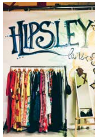
Vintage frocks at Hipsley Lane

like Vanishing Elephant, try itrip iskip ( itripiskip.blogspot.com.au ), while more upmarket Australian women's designers, including Megan Park, Akira and Easton Pearson, are available at Pink Inc ( pinkincboutique.com ). Recharge at Lonsdale Street Roasters ( lonsdalestreetroasters.com ), where the black industrial fit-out with bright yellow accents is the perfect backdrop for a great cup of coffee and a quick snack like the slow-roasted pork panini with coriander and chipotle. ■