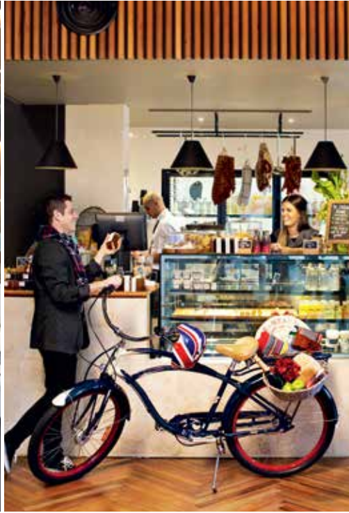
From left: opened last August, the stylish East Hotel's lounge-lobby; the takeaway delicatessen at East Hotel imparts a casual elegance

and hip-hop crews provide the tunes. Serious oenophiles will want to spend some time at Benchmark Wine Bar ( benchmarkwinebar.com.au ), whose extensive list spans the globe, with interesting and lesser-known varieties its speciality. Among the hundred by-the-glass offerings, alongside a 400-strong list by the bottle, you'll find some local Canberra numbers. The city's most sophisticated cocktail bar is also a haven for music lovers. Hippo ( hippobar.com.au ) prides itself on its list – one of the bar's specialities is the Jet Li martini, combining citrus vodka, watermelon liqueur and fresh-pressed watermelon and apple juice – but there's also a side of jazz, blues or Latin served during the week. DJs take over the decks on the weekend.