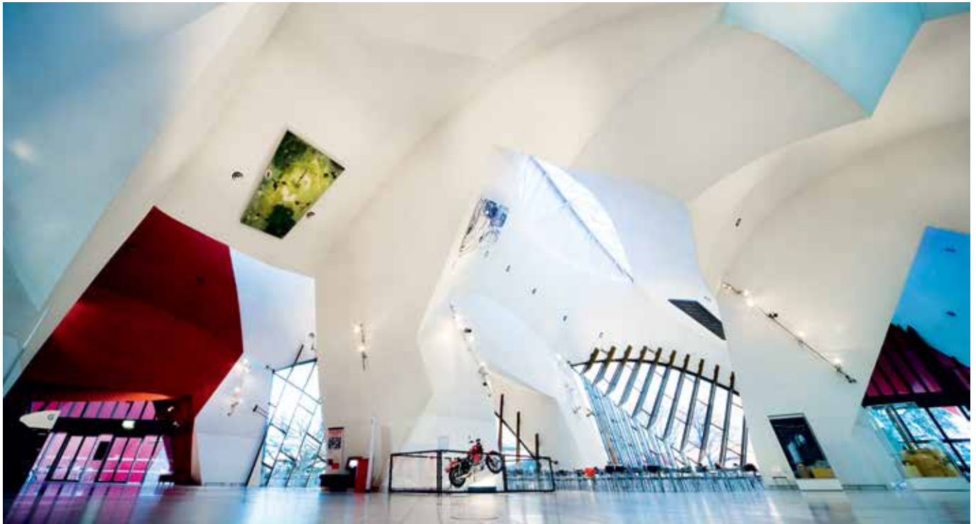
The entrance hall of Canberra's 6,600 sq m National Museum of Australia was designed to look like a huge rope knot - seen from the inside

It's no secret that Canberra has harboured a reputation as something of a sleepy hollow populated by politicians and public servants. Visitors, however, write it off as a destination to their own peril, especially in 2013. Not only does the city possess lively arts and food scenes, stunning architecture and wide green spaces, and a slew of must-visit attractions, but this year also marks its 100th birthday, and the city and its denizens have planned a year long party to celebrate.