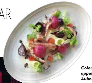
Colourful appetizer at Aubergine