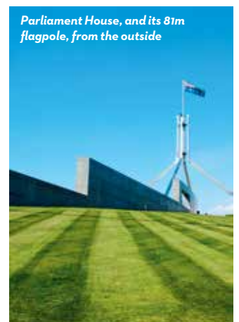
Parliament House, and its 81m flagpole, from the outside

and gives it a funky modern makeover. With a focus on seasonal produce, the menu changes regularly but could include chestnut pappardelle with rabbit ragu or veal shin with soft polenta, asparagus and gremolata. Styled to resemble a Malay kampung - dark timbers, overhead fans, wooden shutters - The Lanterne Rooms ( lanternerooms.chairmangroup.com.au ) sports a menu that traverses the cuisines of Southeast Asia, from Malaysian to Thai, accompanied by excellent service and a solid wine list. With full-length windows overlooking suburban Griffith, you could be forgiven for thinking Aubergine ( aubergine.com.au ) might be your average neighbourhood dining room. Think again. Since 2008, chef and owner Ben Willis has been perfecting his skillful, innovative, Euro-inspired menu that is paired with relaxed, spot-on service. Dishes change regularly but expect offerings like crispy pork belly and spanner crab salad with watermelon and rouille and John Dory with speck, mussels,